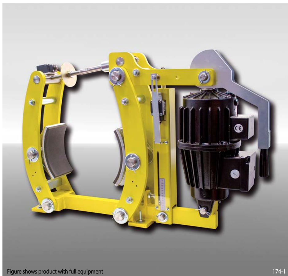
Figure shows product with full equipment

spring activated – electrohydraulically released Drum Brake according to DIN 15 435