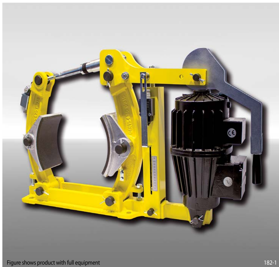
Figure shows product with full equipment

spring activated – electrohydraulically released Drum Brake according to DIN 15 435